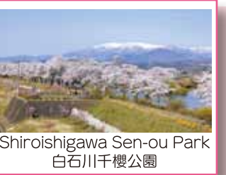
Shiroishigawa Sen-ou Park 白石川千櫻公園