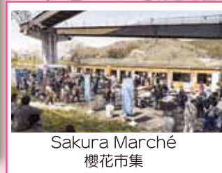
Sakura Marché 櫻花市集