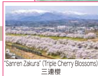
"Sanren Zakura" (Triple Cherry Blossoms) 三連櫻