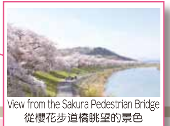
View from the Sakura Pedestrian Bridge 從櫻花步道橋眺望的景色