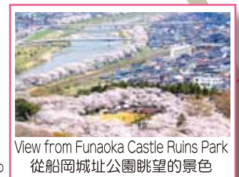
View from Funaoka Castle Ruins Park 從船岡城址公園眺望的景色

※ This is a steep slope; wheelchairs cannot pass. ※ 坡度較陡，輪椅無法通行。