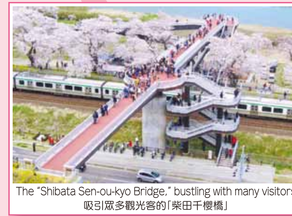
The "Shibata Sen-ou-kyo Bridge," bustling with many visitors 吸引眾多觀光客的「柴田千櫻橋」

歡迎來到「花之町柴田」的船岡城址公園。這個以櫻花聞名的地方，還有四季變換的各種花卉，並可從山頂欣賞壯麗的風景。請一邊散步，一邊享受櫻花之美!