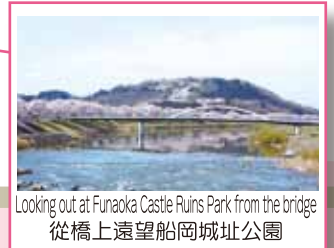
Looking out at Funaoka Castle Ruins Park from the bridge 從橋上遠望船岡城址公園