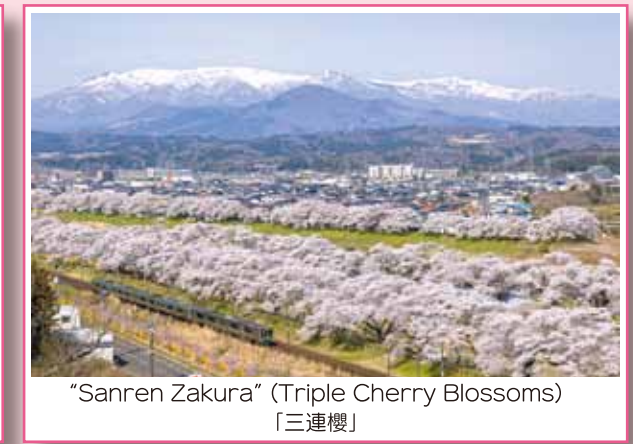
"Sanren Zakura" (Triple Cherry Blossoms) 「三連櫻」