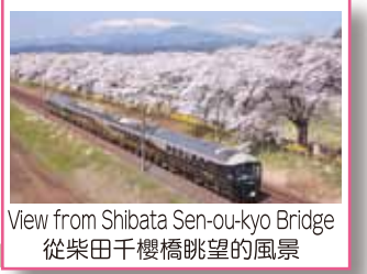
View from Shibata Sen-ou-kyo Bridge 從柴田千櫻橋眺望的風景