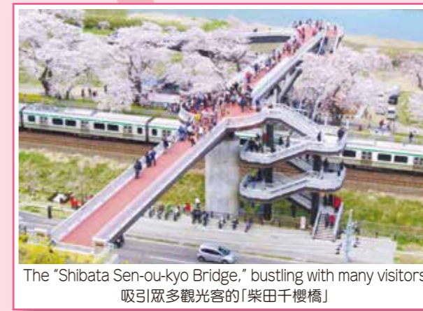
The "Shibata Sen-ou-kyo Bridge," bustling with many visitors 吸引眾多觀光客的「柴田千櫻橋」

歡迎來到「花之町柴田」的船岡城址公園。這個以櫻花聞名的地方，還有四季變換的各種花卉，並可從山頂欣賞壯麗的風景。請一邊散步，一邊享受櫻花之美!