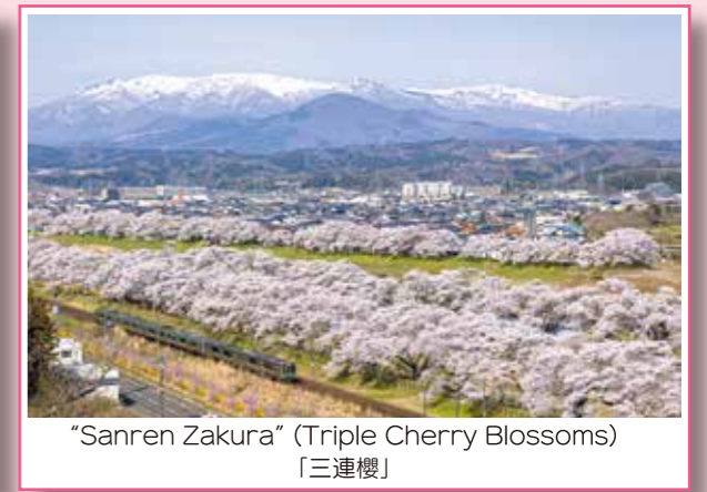
"Sanren Zakura" (Triple Cherry Blossoms) 「三連櫻」